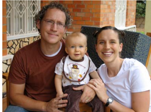
Thanksgiving 2009 was truly a time to think back over the year and count our many blessings!